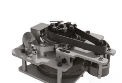
Turnstile mechanism – high standard brake with short response time.