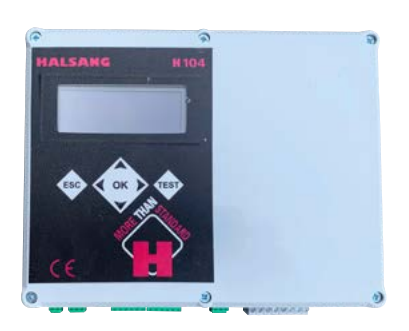
Electrical cabinet equipped with a Halsang H104 controller and frequency modulators

TECHNICAL DESCRIPTION Total height 2,530 mm Other dimensions: on request. Power supply voltage 230V AC, 50 Hz Power consumption max 120 W Current 5A Feedback signal Potential free contact - no/nc Opening signal Signal (max. 1 sec) Operation environment -25° to +50° C Weight 500 kg Relative humidity Environmental 10-80% IP protection rating 44 Cabinet Stainless steel, 1.5 mm Cage Profiles 100x50x3 mm, 60x60x2 mm, 60x30x3 mm and 25x25x1.5 mm Spindle core tube 90x3 mm Spindle arms 38x2 mm